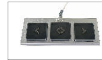
Footswitch Part No : LS10030000