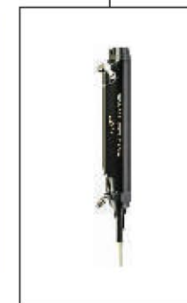
Shaver Handpiece Part No : LS 10020000