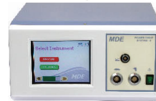
Control Unit Part No : LS 10010000