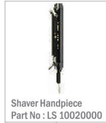
Shaver Handpiece Part No : LS 10020000