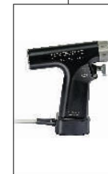
Corded Powerdrive Part No : LC 10020000