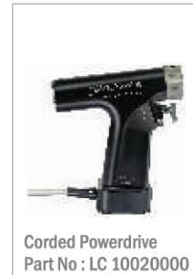
Corded Powerdrive Part No : LC 10020000